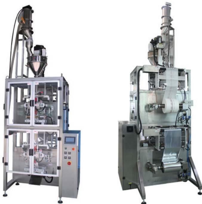
PM-420P-BIB with auger screw filler & vacuum transfer elevator refiller