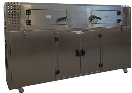
SST-1500/ SST-2500 Steam Tunnel