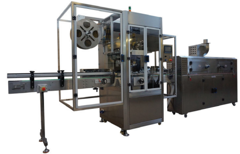
APTB-250 couple with Steam Tunnel